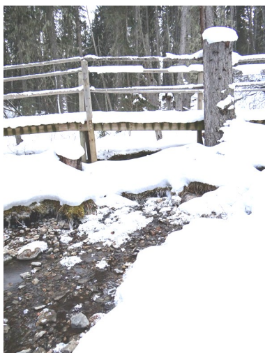
Bridge to Valaqua chapel.

I n our northern climate, the changing of the seasons is a natural part of life. The season of waiting for “God with us” is followed by an exploration of Jesus’ manifestation and purpose, drawing us to a deeper sense of our own calling. The nudges and urges that arise in this season of new beginnings invite us to live out our call together with others, in community. “Community” is what MCA is about!