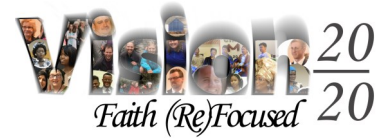
Pictured: Top to Bottom: Congregational Leadership, Community Building, Mission & Service, Executive

In 2018 and 2019, the Vision 20/20 process led us through a deeper understanding of our time and place in the cycles of the Church. Vision