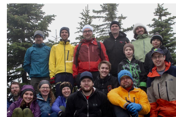
2018 Hike-a-Thon, a Camp Valaqua fundraiser

year to include a challenge between Edmonton and Calgary. Game on!