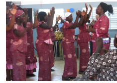
Worshippers at the Burkina Faso Mennonite Church anniversary celebrations.