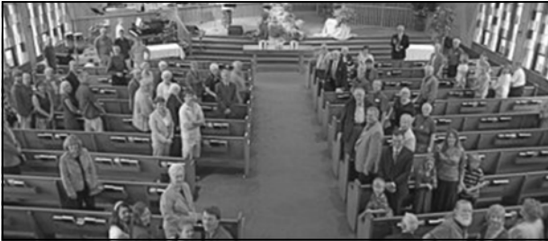
Bethany Mennonite Church 50 years