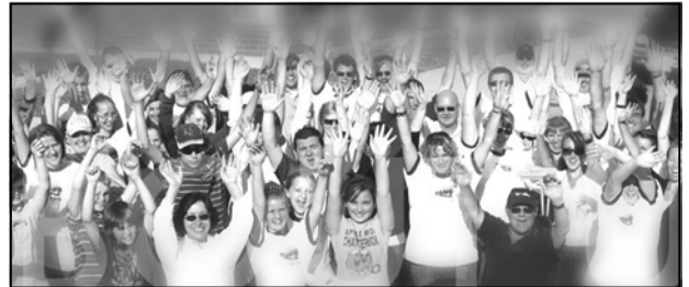
The Gathering Church 10 years