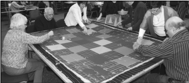
Wellesley Mennonite Church 40 years