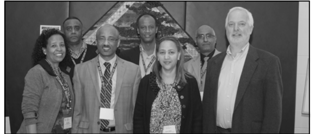
Church of the Living Word in Ottawa 10 years